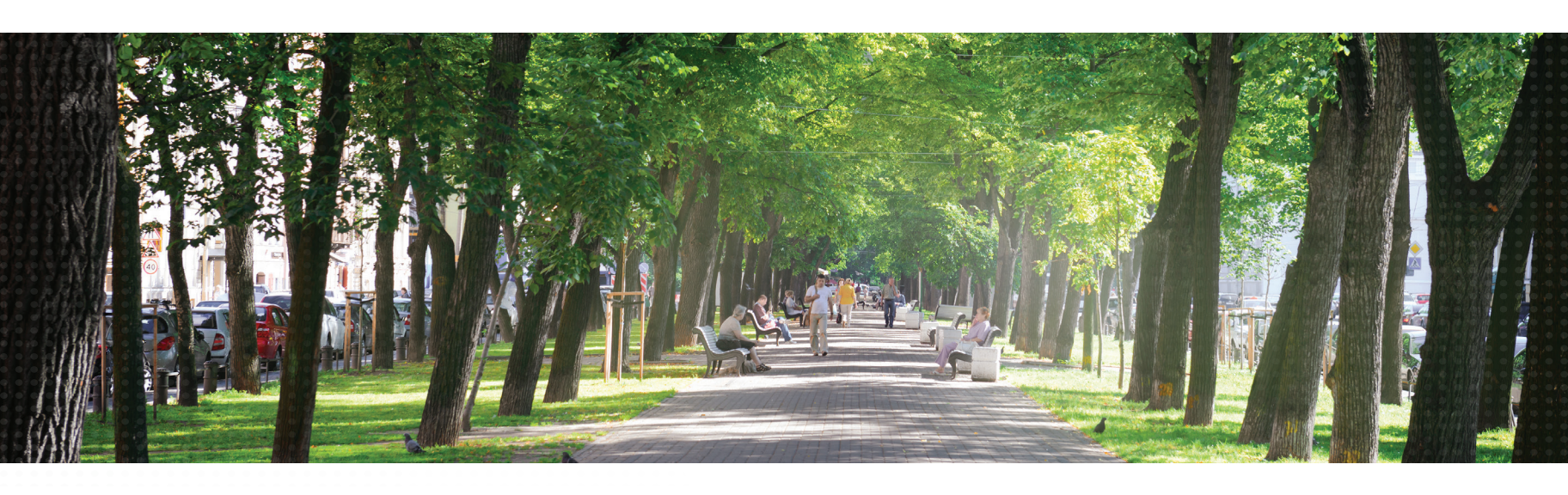
Myth 09: Women Will Save Enough for Retirement if They Set Up a 401(k) and Play by the Rules

contribute to their 401(k) plans, the likelihood they'll enjoy a worry-free and comfortable retirement remains slim. But while it's easy to view women's retirement years in bleak terms, there are some small steps we can take today that will change our outcomes for the better.